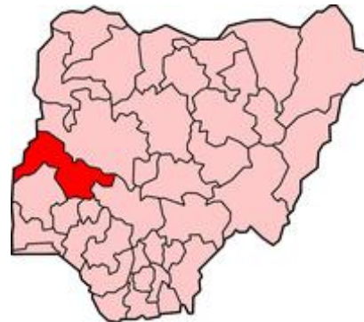
Figure 1: Map of Nigeria indicating kwara state

background of the respondents, sources and perceived level of risks encountered, and the coping strategies employed. The study was also complemented with data from published and grey literature.